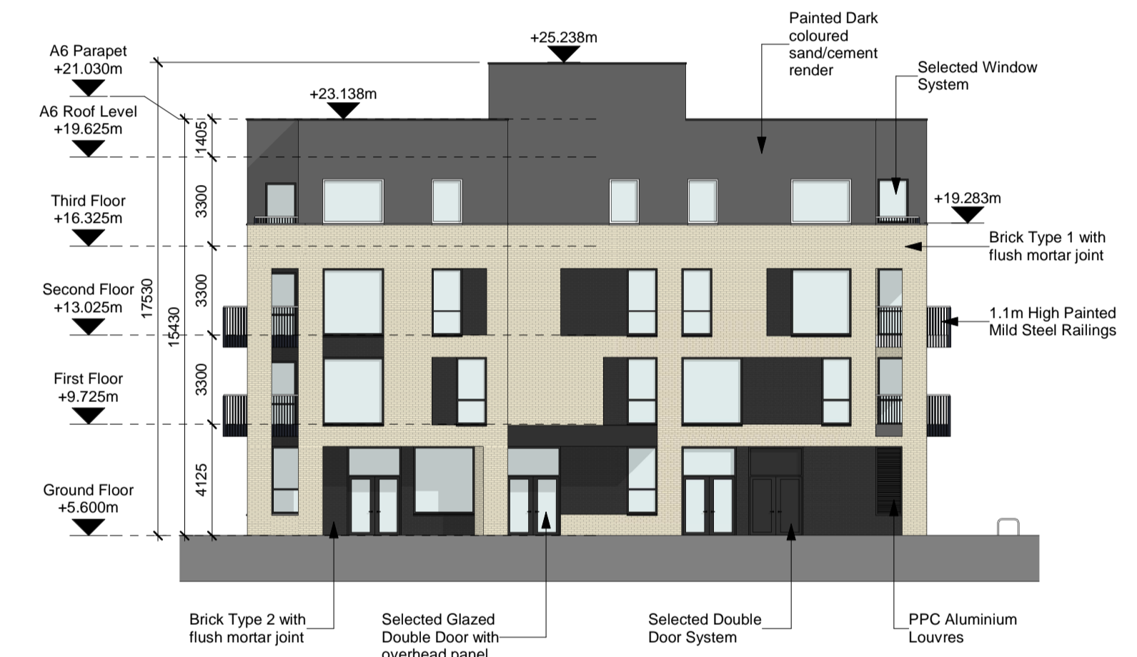
7 East Elevation 1 : 200