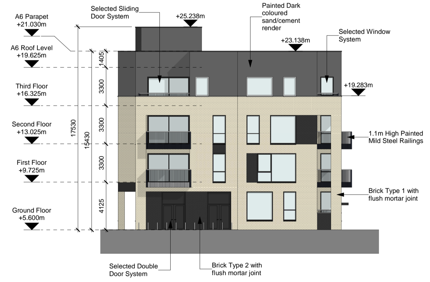
5 North Elevation 1 : 200