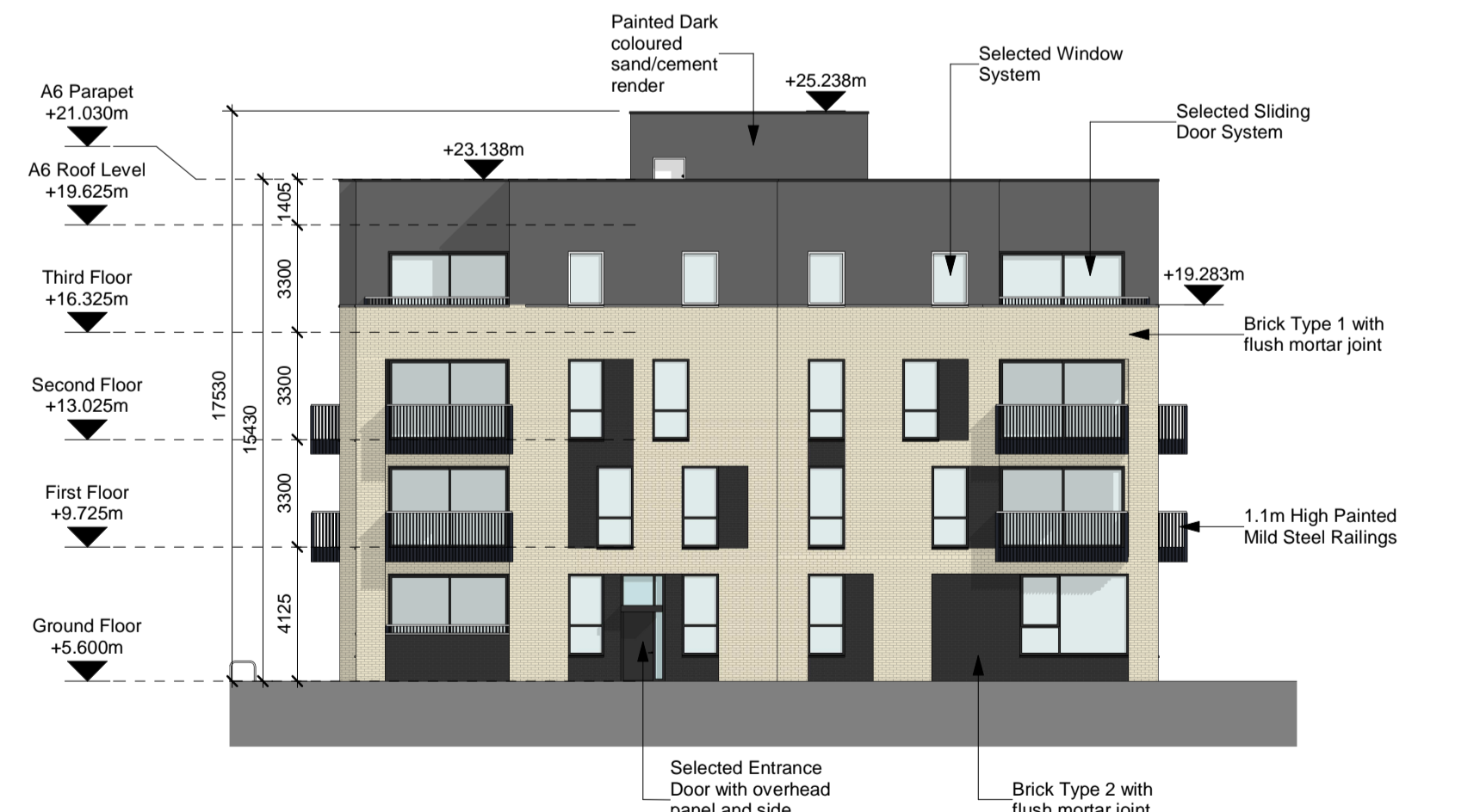
8 West Elevation 1 : 200

NOTE: Refer to Architect's Design Statement for selected material & finishes on buildings.