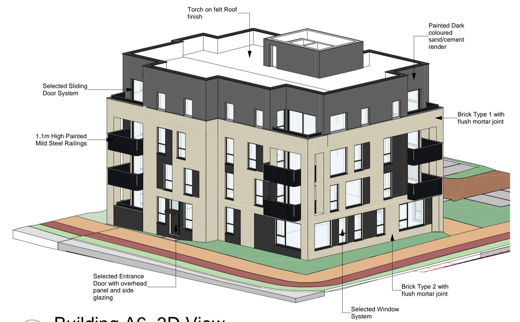
2 Building A6, 3D View