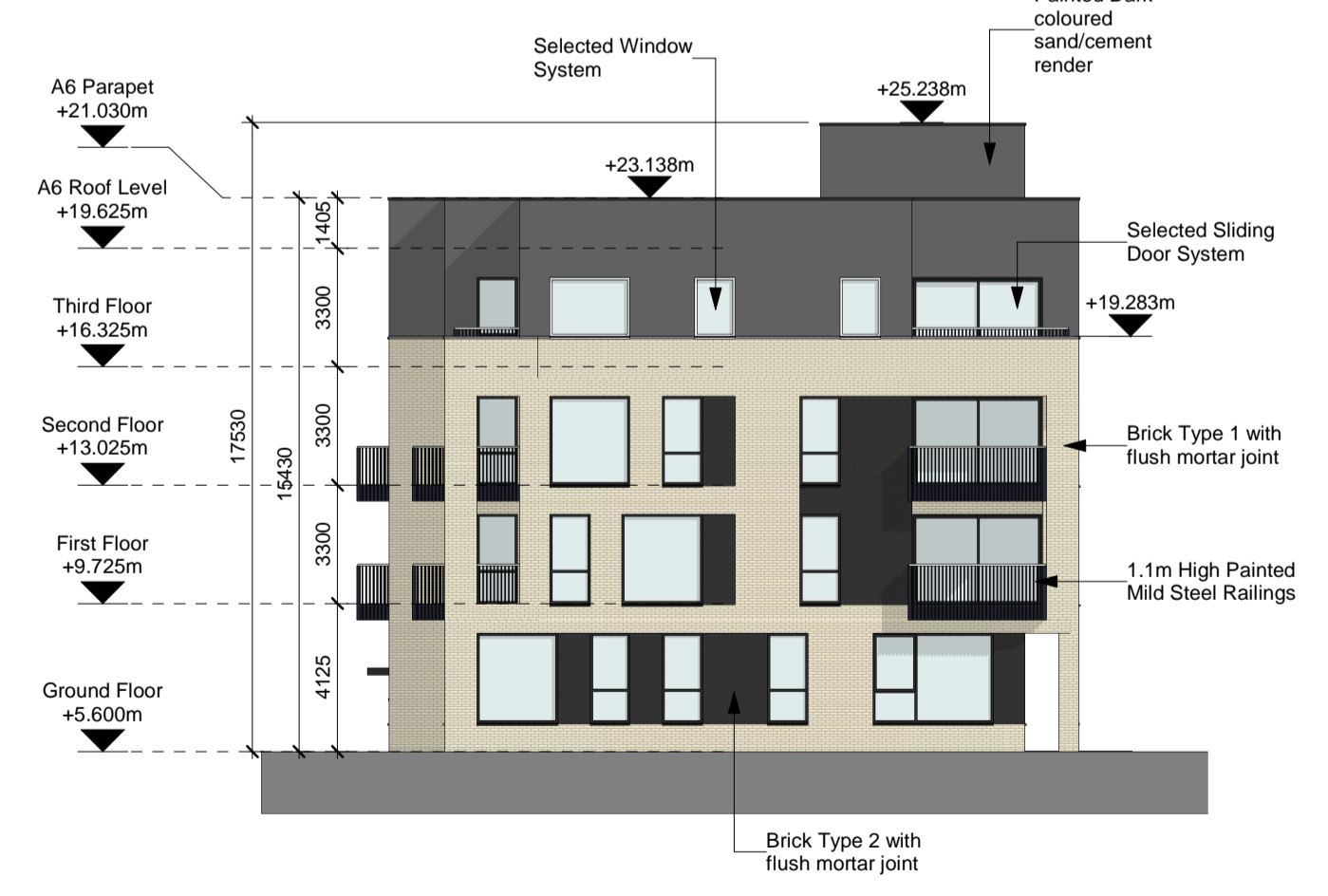
6 South Elevation 1 : 200